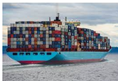
Cargo ship moving goods across the sea.

Fair Trade is a way of trading that helps farmers in poorer countries to be paid fairly for what they produce .