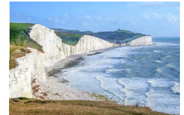
The Seven Sisters chalk cliffs in East Sussex.