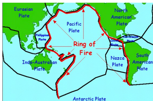
An area with a large amount of volcanoes