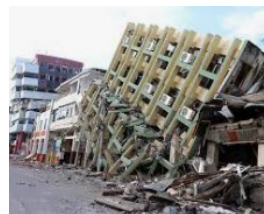
Damage caused by an earthquake