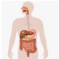
The digestive system