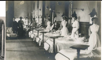
WW1 War hospital