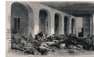
Crimean War—field hospital

28 July 1914 – 11 November 1918– World War one