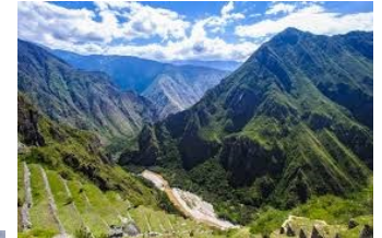
Mountains (Andes Range)