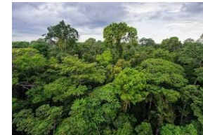
Rainforest (The Amazon)