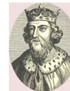
King Alfred the Great

1066 - The Normans conquer (take over) England