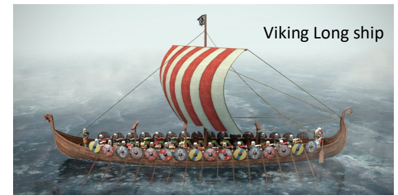
Viking Long ship