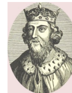
King Alfred the Great

1066 The Normans conquer England. The end of the Anglo-Saxon and Viking era.