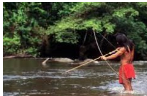
Indigenous people use their environments to meet their needs