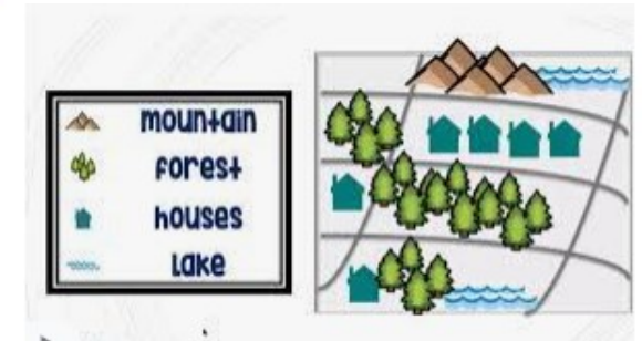
A map key with symbols