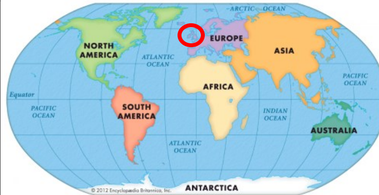
The Battlefield at Senlac Hill

We will learn to use a compass and read the directions on it .