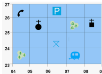
A map that uses 4 figure grid references