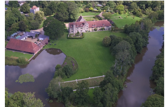
An oblique aerial photograph showing the area around Michelham Priory today.