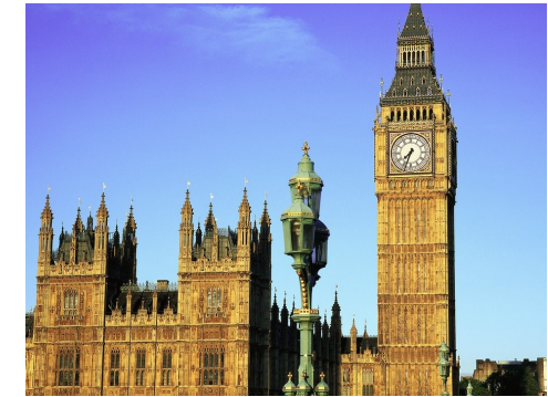
The Houses of Parliament in London