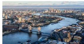
The River Thames in London