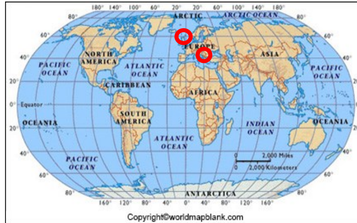
Map of Greece

We will learn about the environments of both countries and we will compare their climates