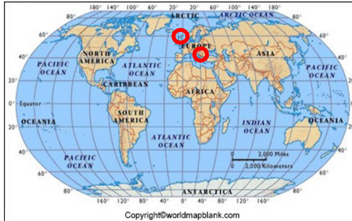
Map of Greece

In our geography lessons this term we will be learning about Greece and Scotland and why they are both popular tourist destinations. We will discover their locations in relation to other countries in the world. We will learn about the environments of both countries in terms of the Key topographical features and we will compare the climates of the two countries. We will learn about the distance between the countries and the position of the countries in the World.