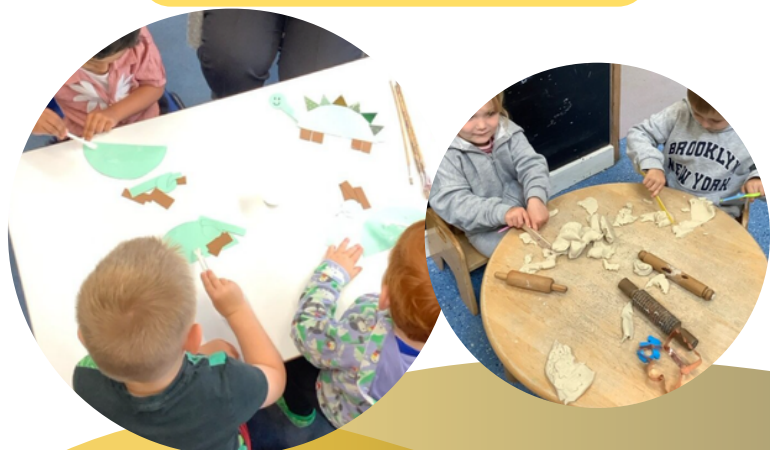
Caption: Nursery were getting creating with their fine motor activities this week!